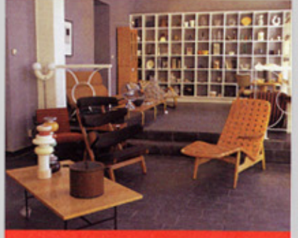
STOCKHOLM Modernity offers the best Scandinavian-designed home furnishings of the 20th century.

SVENSK TENN, 5 STRANDVÄGEN (46-8-670-1600), WWW.SVENSKTENN.SE Every Swede has some Svenskt Tenn fabric somewhere in his life, but it's very un-