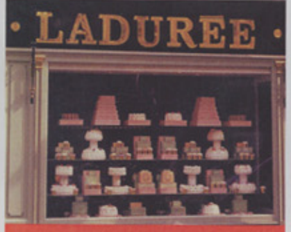
PARIS Ladurée is famous for its perfect macarons.

ANTIQUE WALKING STICKS M.G.W. SEGAS, 34 PASSAGE JOUFFROY (33-1-47-70-89-65), WWW.CANESGAS.COM Tucked into the Passage Jouffroy, this beautiful shop is dedicated entirely to antique walking sticks. Parrot heads, monkey heads, clenched fists, and a finely turned ankle are among the countless different handles on the many sleek, shiny sticks made of every imaginable wood. SSSS